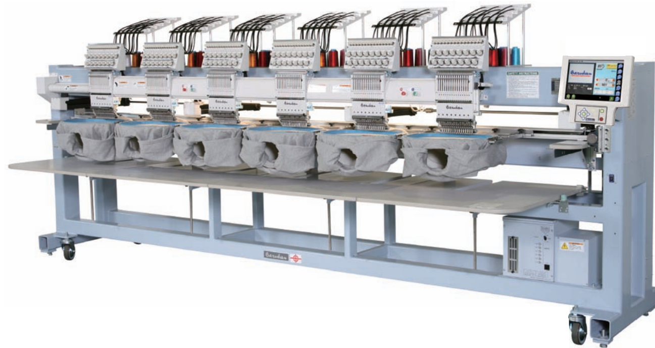
6-Head - BEKY-S1506CII