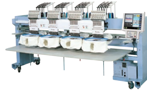
4-Head - BEKY-S1504CII