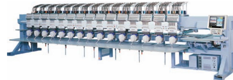
15-Head - BEKS-S1515C

Heavy-duty, steel construction provides stability and minimum vibration resulting in superior stitch quality. Designed to be compact and powerful, our machines will fit through most standard doors so you can set up shop almost anywhere.