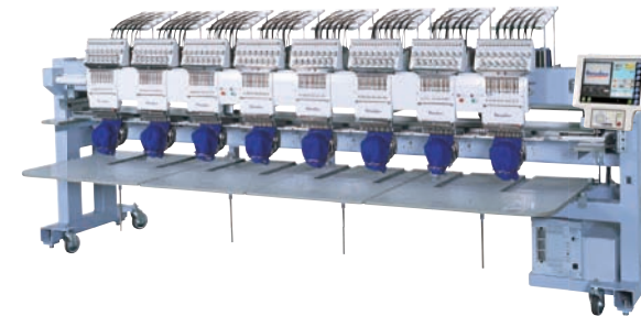
8-Head - BEKY-S1508CII